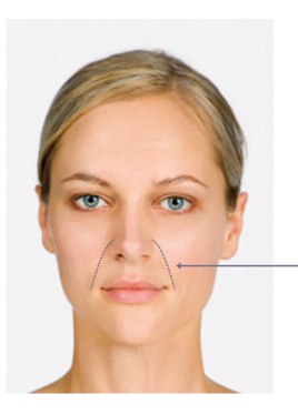
Figure 1: Location of nasolabial folds

Hyaluronic acid ( HA ) is a naturally occurring substance found in the human body. Your body's own HA helps maintain the skin's structure and its natural feel.