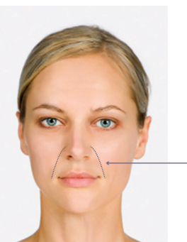
Figure 1: Location of nasolabial folds

Hyaluronic acid (HA) , is a naturally occurring substance found in the human body. Your body's own HA helps maintain the skin's structure and its natural feel.